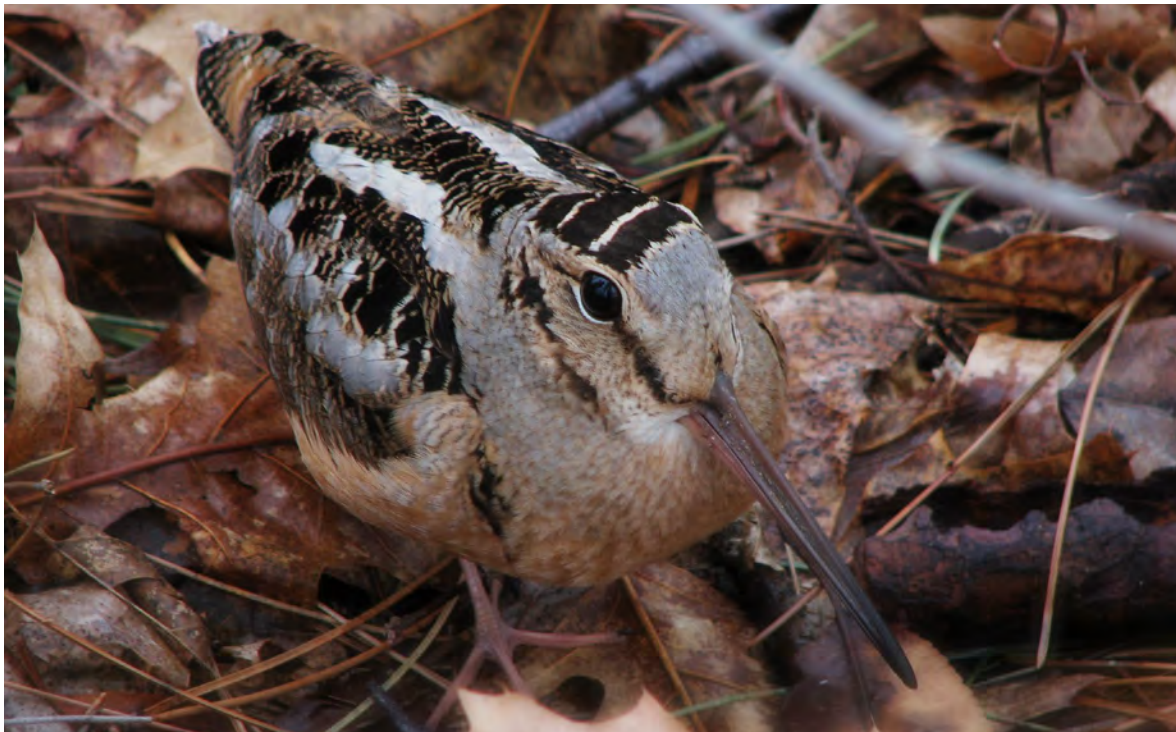
American Woodcock, Scolopax minor , also known as the Timberdoodle. Lights Out DC found 23 in 2014.

Dead, injured or exhausted birds were found at 107 locations. They are listed in Table 2 along with the number of birds found at each. For more detailed information, please see the attached data table "Lights Out DC 2014 Locations Found."