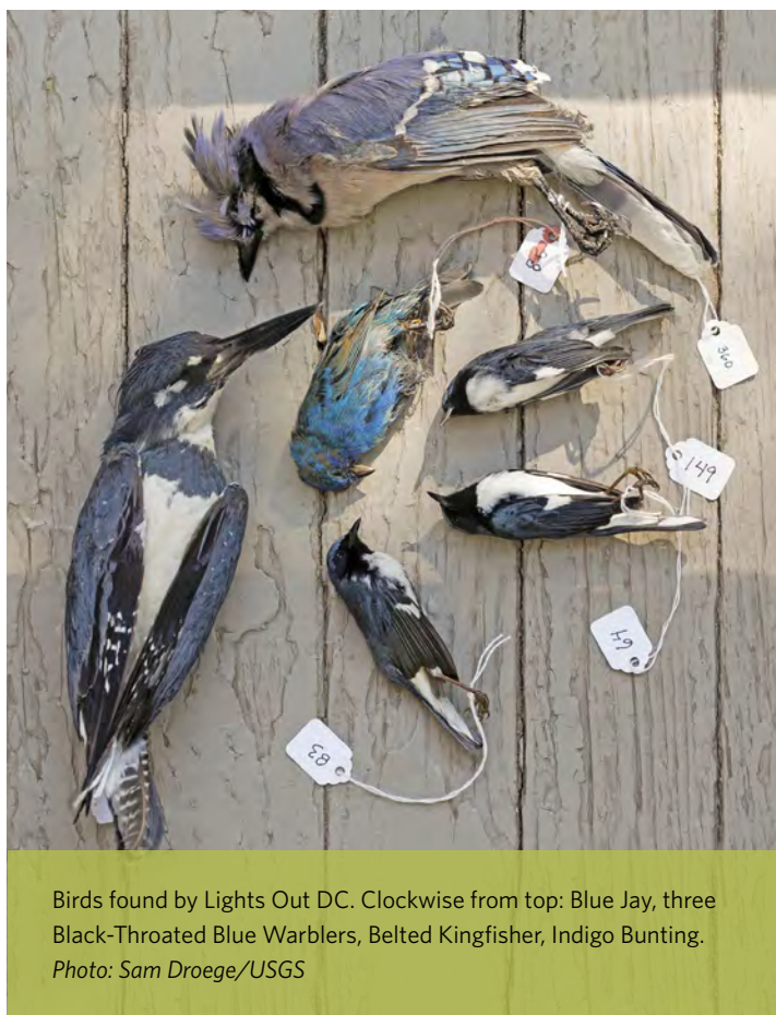
Birds found by Lights Out DC. Clockwise from top: Blue Jay, three Black-Throated Blue Warblers, Belted Kingfisher, Indigo Bunting.

Volunteers met at 5:30 a.m. every morning throughout the months of April, May, September, October and into November