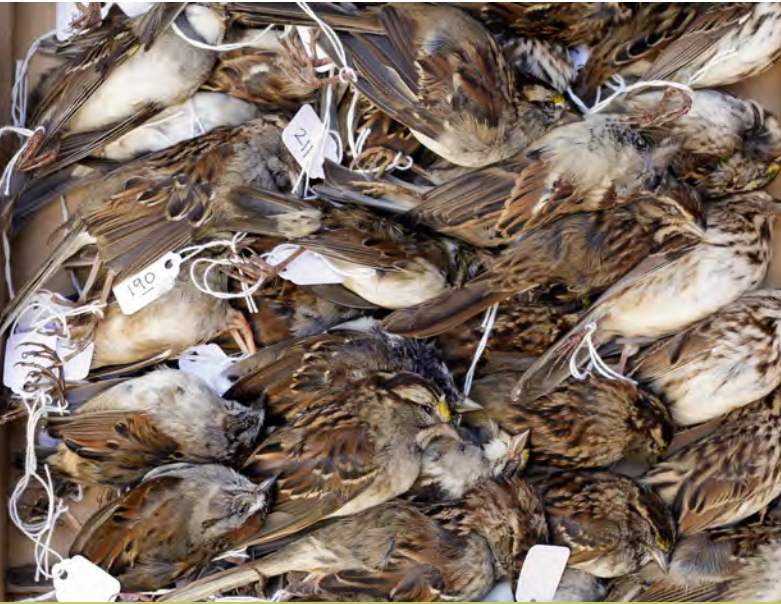
Various species of sparrow found in 2014 by Lights Out DC.

Dead birds were collected in plastic bags. The date, location found, and species were written on the bag. The specimens were frozen and later given to the Smithsonian Institute's National Museum of Natural History. Of the 414 total birds found in 2014, 58 were injured or stunned, but recovered sufficiently that they could be released later that day by Lights Out DC volunteers.