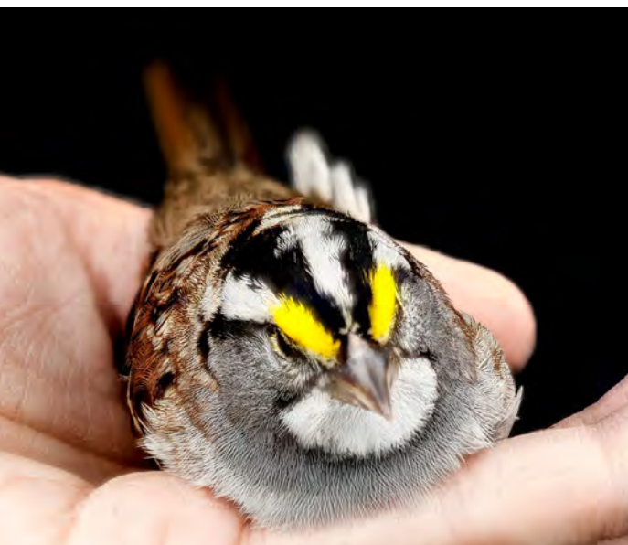
White-throated Sparrow, Zonotrichia albicollis , that died in downtown Washington, D.C. from striking a building at night. Lights Out DC found 64 in 2014.

61 species of birds were collected; 11 of those are listed as species of greatest conservation need in the District of Columbia