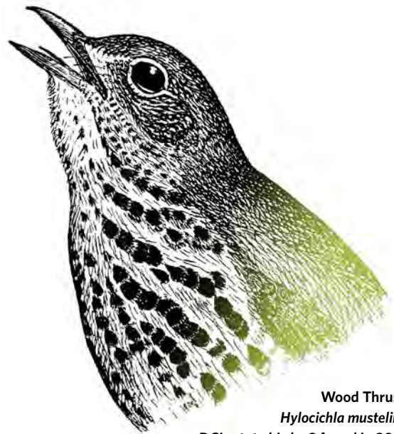
Wood Thrush, Hylocichla mustelina , DC's state bird—8 found in 2014.