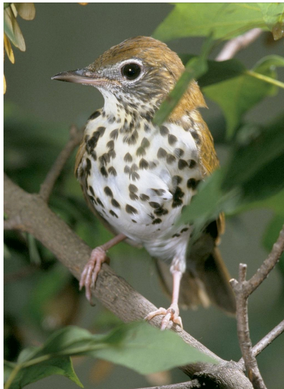
Wood Thrush (the official bird of the District of Columbia)