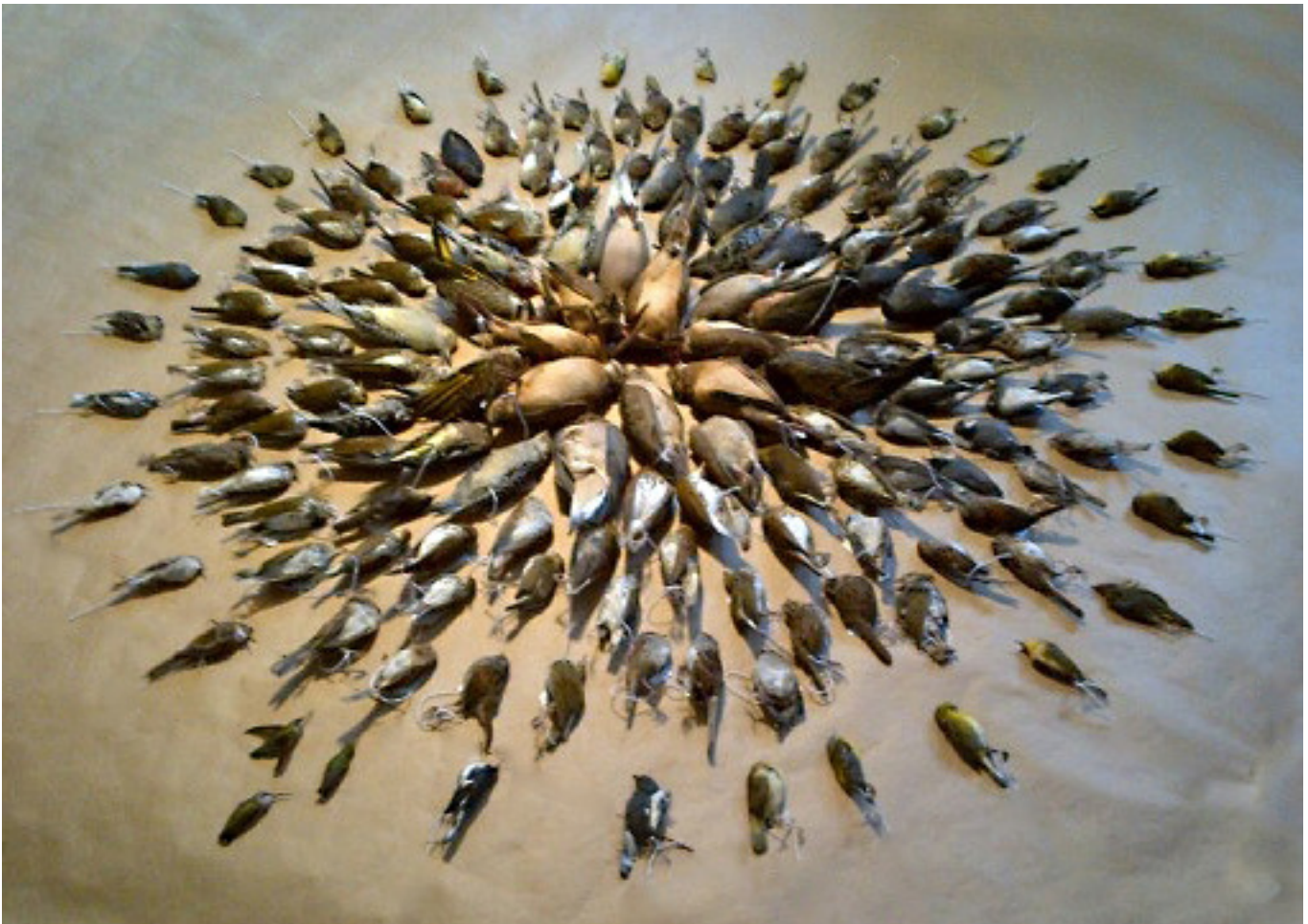
Birds Collected in the Spring & Fall of 2012

The following list includes all 53 species of birds found by Lights Out DC volunteers in 2012. A total of 208 individual birds were picked up. For more detailed information, please see the attached data table “ Lights Out DC Bird Inventory, 2012.”