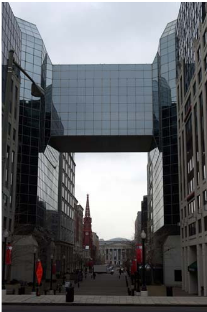
800 K Street, NW, District of Columbia

Dead, injured or exhausted birds were found at 45 locations. They are listed below along with the number of birds found at each. For more detailed information, please see the attached data table.